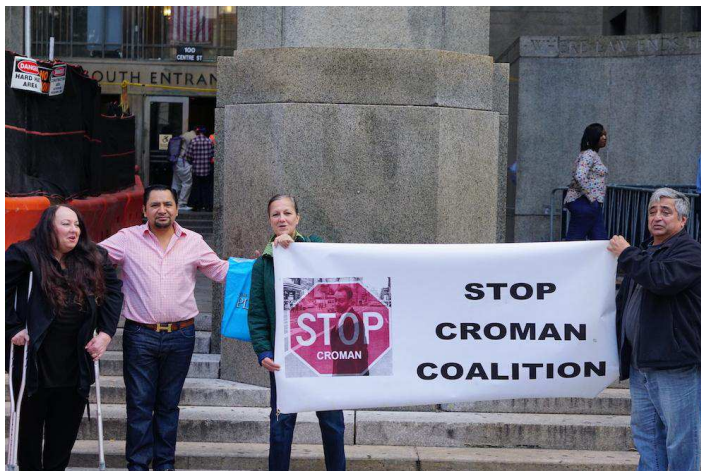
Activists and tenants assembled outside of the courthouse.

Jasz shared a story about his next-door neighbor: “A friend of theirs was staying there for a few days and had a dog. The silica dust was in water puddles, the dog licked it up and died three days latter.”