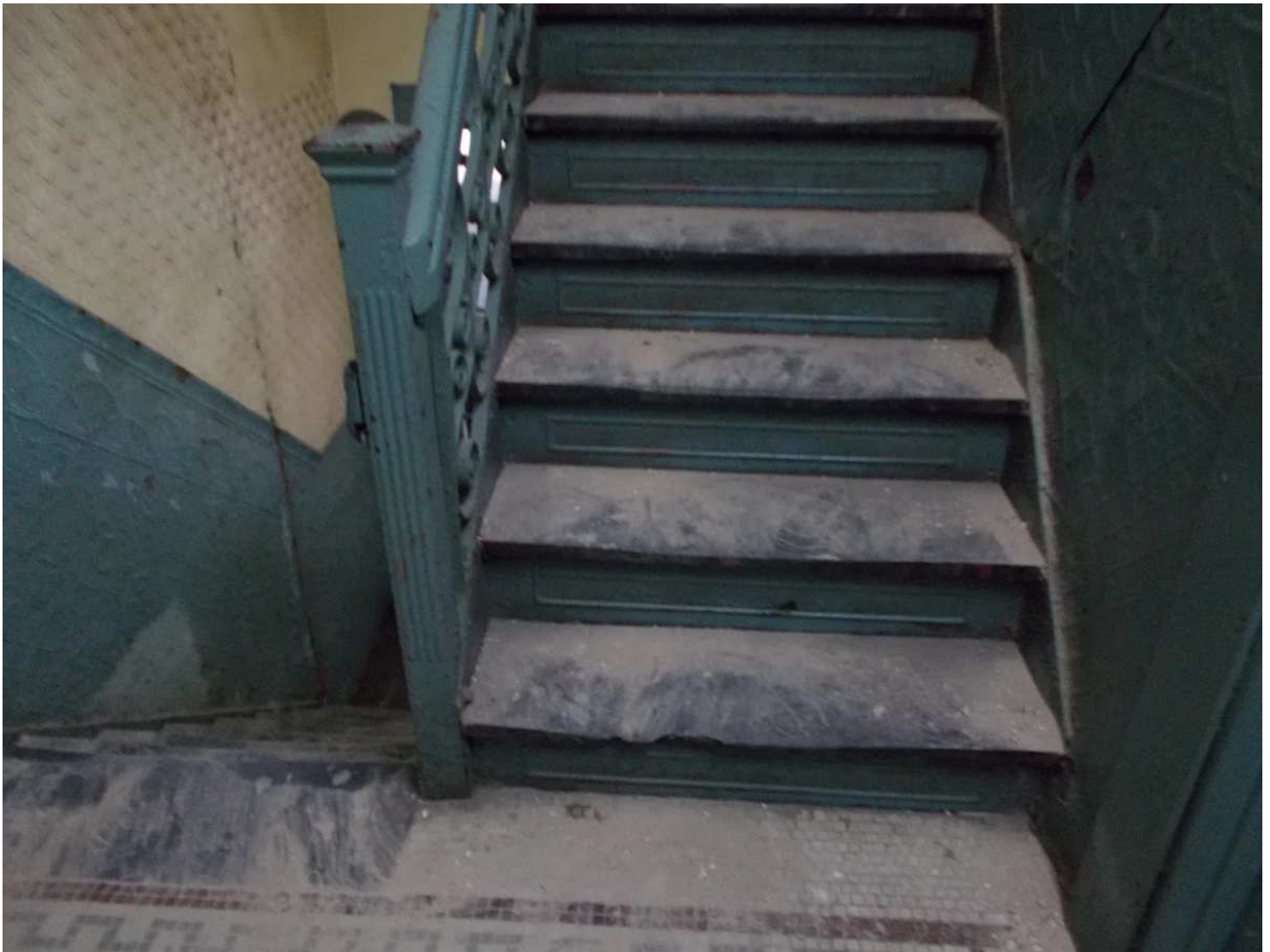
Dust floated freely through the halls of Tang's apartment building during his landlord's renovation.

Tang's ceiling collapsed three times—twice upon his mother's unoccupied bed—during Marolda's renovation of the apartment above his own. Over the course of the 18 months Marolda owned the property, bundles of debris lined the building's hallways, dust swirled without mitigation and new leaks sprung, spreading water damage to Tang's apartment. Exposed wires hung from the ceilings and the noise of hammers and power tools persisted long after working hours.