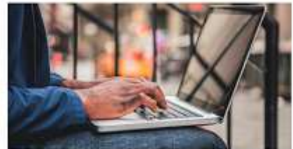
The 25 best NYC neighborhood blogs in 2016 Your digital dossier of 25 pre-ground NYC news outlets. BY THE WAY

NAMED ONE OF THE BEST NYC NEIGHBORHOOD BLOGS IN 2016