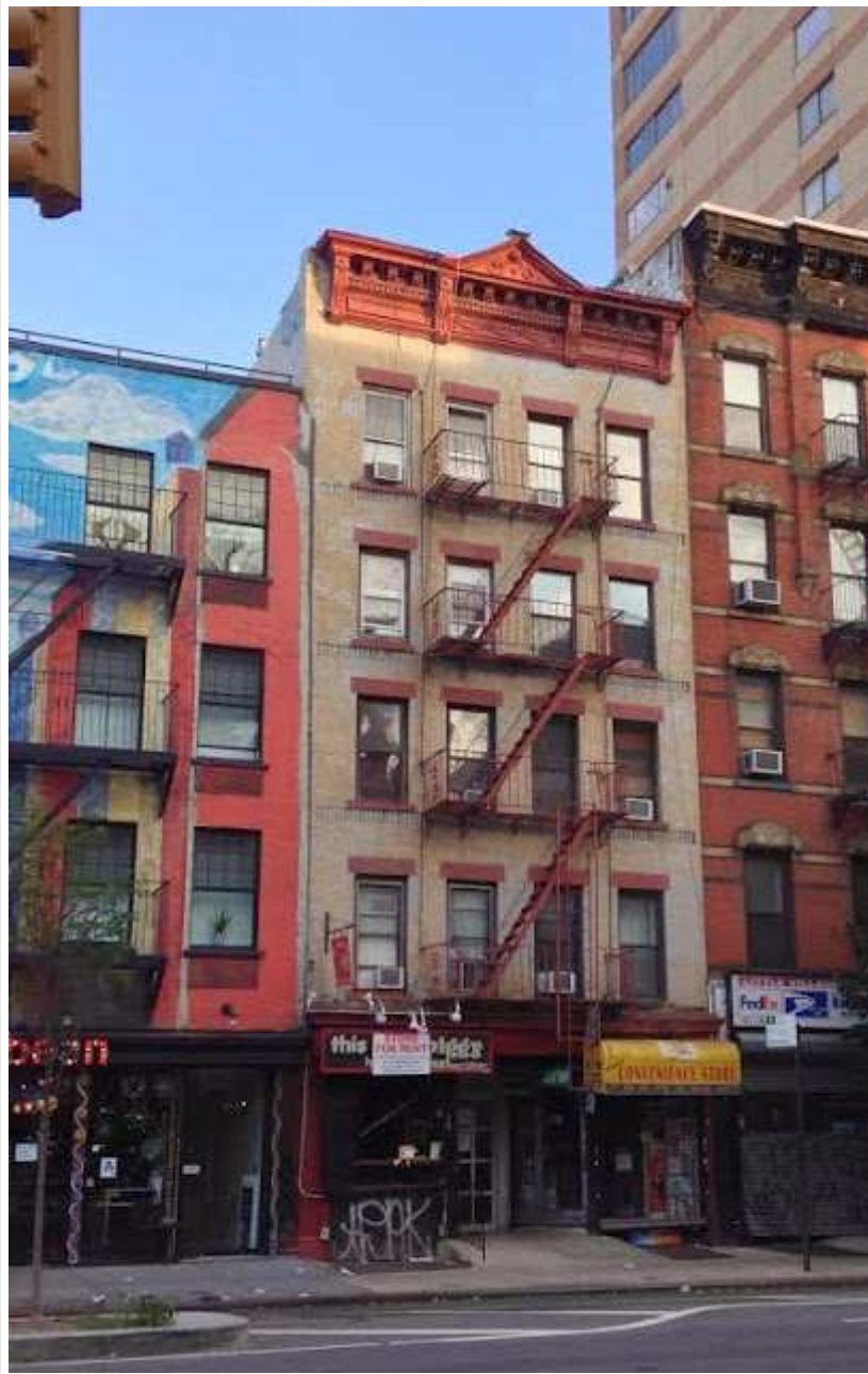
[EVG file photo of 149 First Ave.]

The Village Voice released its list of the worst NYC landlords yesterday.