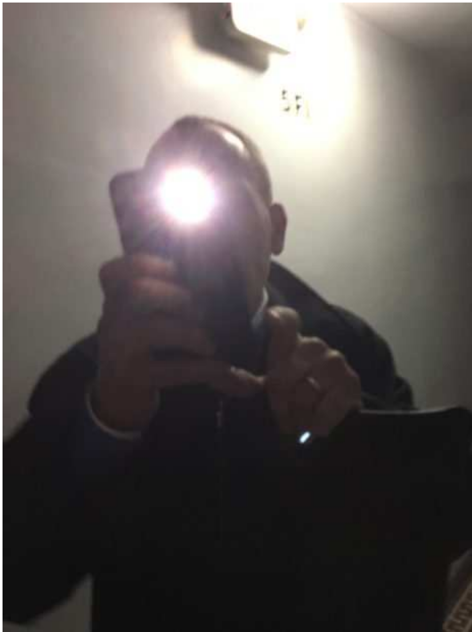
Croman shining light at a tenant to prevent filming

Posted on: June 7th, 2017 at 5:18 am by Elie ( http://www.boweryboogie.com/author/elie/ )