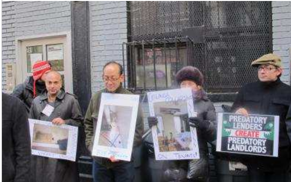
HAD ENOUGH: Residents of 159 Stanton St. protest outside their building.