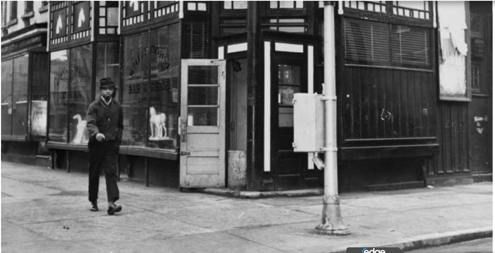
The White Horse Tavern in 1961.

This paper's investigation thus far seems to trace all this back to an upcoming application for a new liquor-license application for the White Horse Tavern by Eytan Sugarman. The item appears on the Community Board 2 calendar for its March 14 Liquor Licensing Committee 2 meeting.