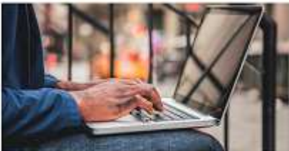
The 25 best NYC neighborhood blogs in 2016 Your digital dossier of all the ground NYC news outlets. [ARCHITECTURE] [ARTS] [CITY]

NAMED ONE OF THE BEST NYC NEIGHBORHOOD BLOGS IN 2016